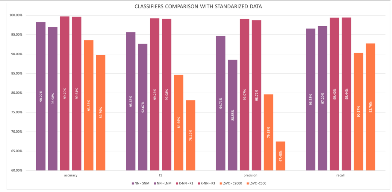
Figure 2. Best classifiers comparison using standardized data.

We used the implementation provided by the SciKit-Learn machine learning package for Python (Pedregosa et al., 2011) to solve a binary classification problem (either benign or malignant). For classification, the K-NN algorithm classifies instances based on the classes of their nearest neighbors in the training set. SVM, on the other hand, can solve classification and regression problems by projecting instances into higher dimensional spaces using kernels. In this work we used linear SVC (LSVC).