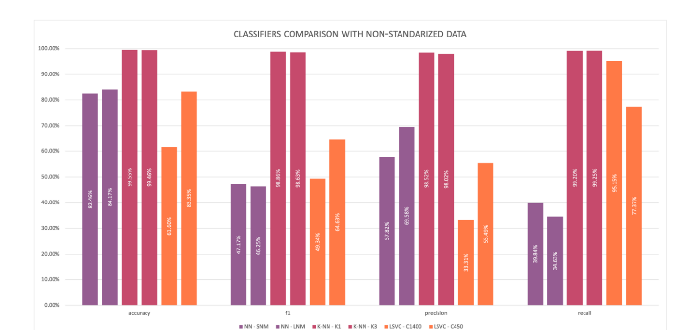
Figure 3. Best classifiers comparison using non-standardized data.