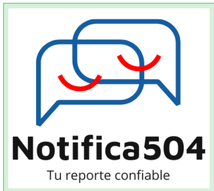
Fig. 3 Graphical representation of proposed tool.

Contacto: elizabeth.valle@unitec.edu Conflicto de interés: ninguno