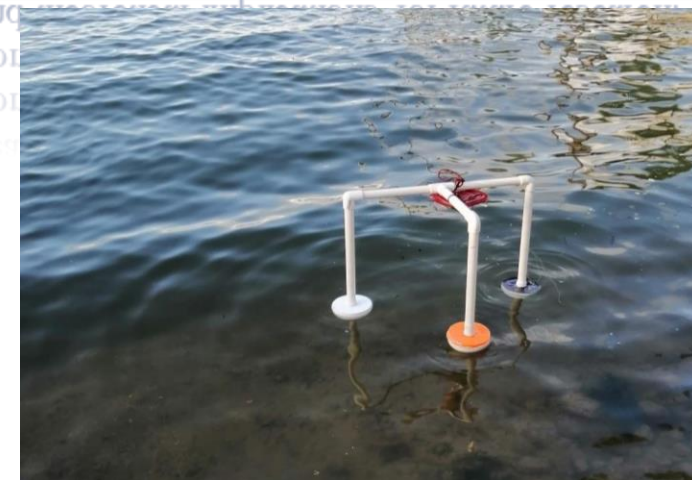
Fig. 2. Field Test Puerto Cortes

The effective integration of an Arduino microcontroller and the use of an ESP32 module have optimized data management, ensuring seamless transmission of information through IoT connectivity. These results represent a significant contribution to the field of study and have practical and theoretical implications for future research.