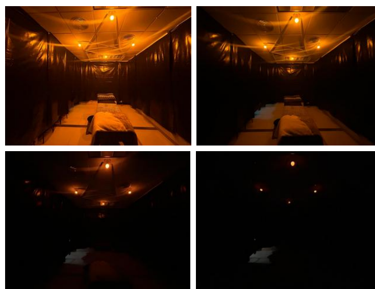
Figure 1. Light intensity levels experienced by participants

The study took place in the biomedical engineering laboratory at the university where the participating students are enrolled. Each session lasted 30 minutes, during which the light intensity gradually decreased from 100% to 0%. This progressive dimming was specifically designed to simulate the natural progression of sunset and nightfall, creating a calming atmosphere conducive to relaxation.